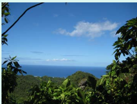
A view on the cross-island hike