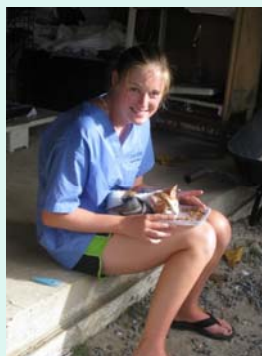
A cat with fish poisoning