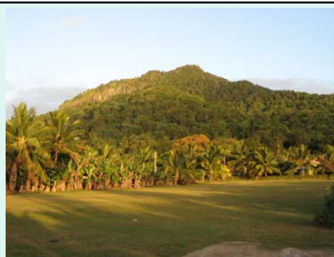
Another view along the way