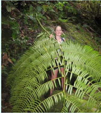
Believe it or not...not all branches can support your body weight