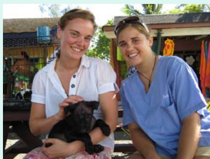
Working at the Saturday market...with Gremlin