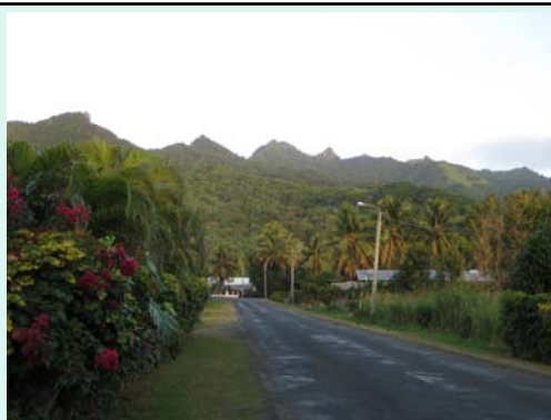
On the way to the clinic