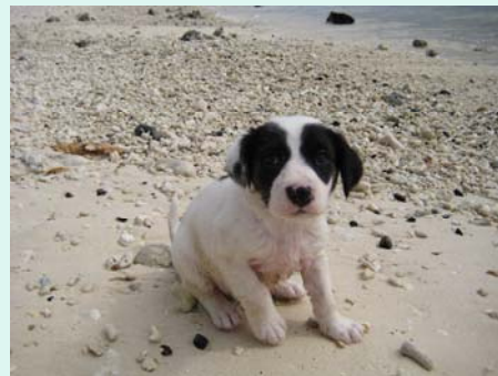
After Pompom's first swim