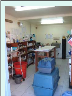
The big surgery room