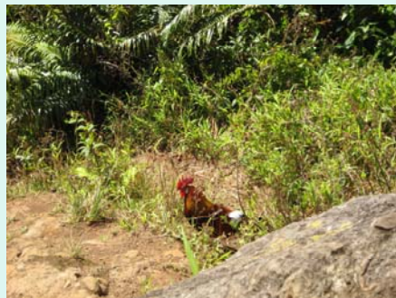
The stalking rooster