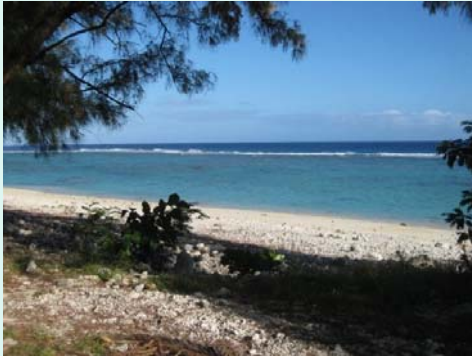
Across the street from the clinic...