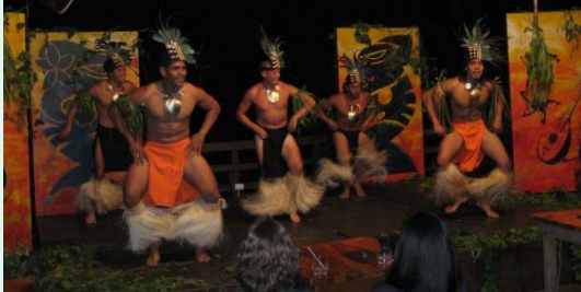
Dance and Music