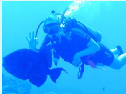
Big Blue and I